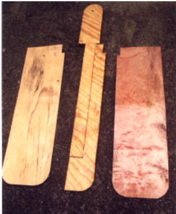
a77. The parts for the lower half of the rudder... the plywood "skins" and a "key."