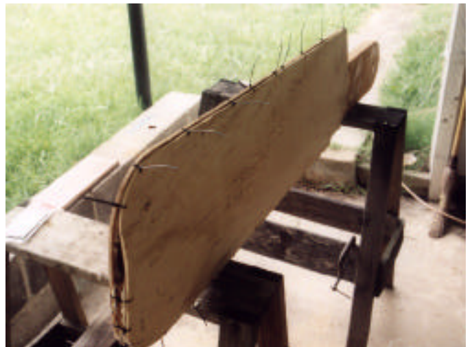
a78. Everything assembled with zip ties.