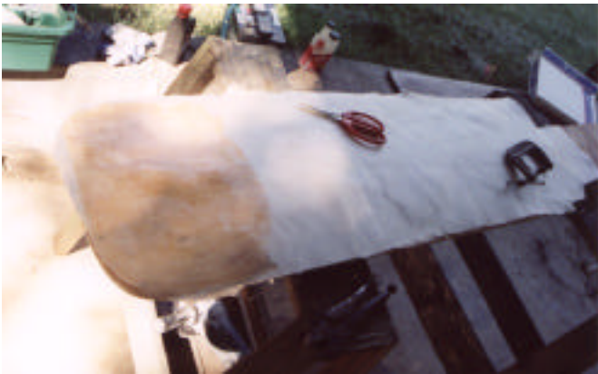
a79. Laminating the exterior with a layer of fiberglass cloth and epoxy.