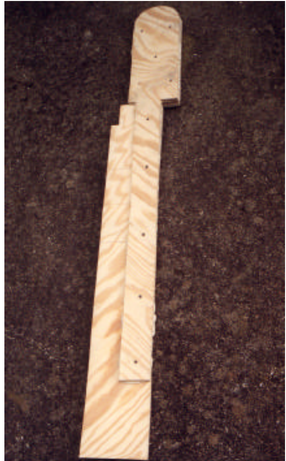
a76. When glued and screwed together, the "key" forms a very strong, rigid structure.