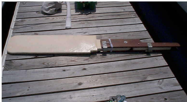
a81. A fabricated replacement rudder before installation.

One mistake that I did make was trusting the people at Lowes who said this was exterior plywood... it wasn't, as the trailing edge of my rudder began to separate after about a month in the water. It was fairly easy to correct with a little more gorilla glue and some epoxy and glass over the trailing edge.