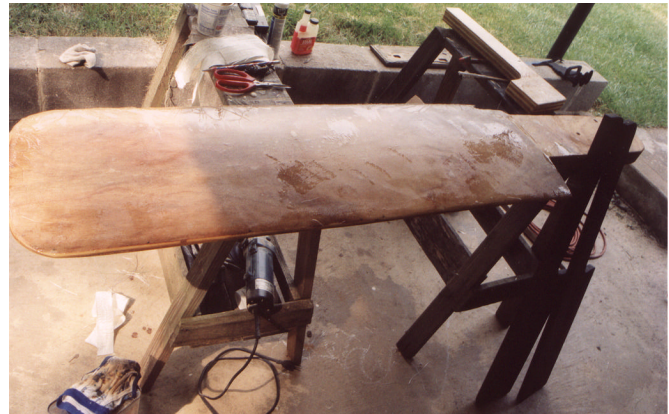
a80. The lower rudder saturated easily, and now is ready for sanding and painting.

point of the blade. If the pressure against the blade causes it to kick up too easily, then it's a simple matter to increase the tension or number of wraps on the bungee cord.